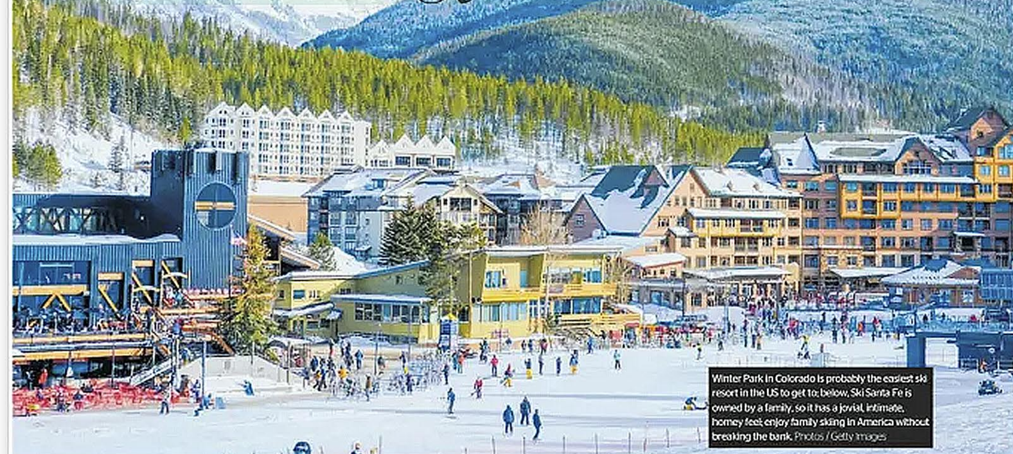
Winter Park in Colorado is probably the easiest ski resort in the US to get to; below, Ski Santa Fe is owned by a family, so it has a jovial, intimate, homey feel; enjoy family skiing in America without breaking the bank.